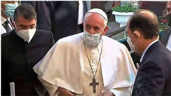
Pope Francis