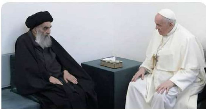
Pope Francis holds historic meeting with revered Shia cleric in Iraq's Najaf

The papal meeting with the 90-year old Sistani — who rarely appears in public — represented one of the most significant summits between a pope and a leading Shia Muslim figure in recent years