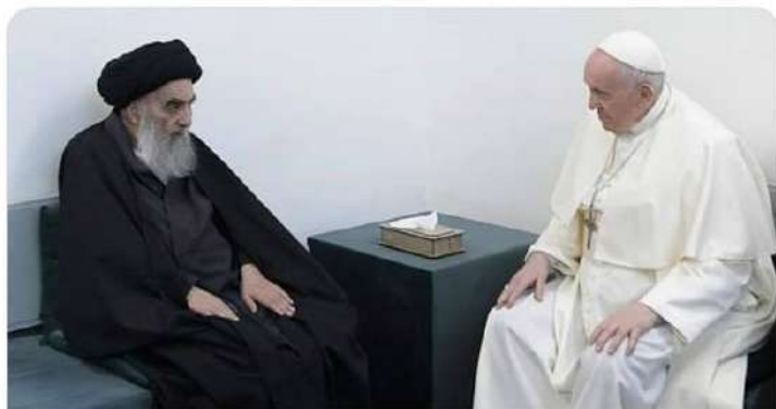
Pope Francis holds historic meeting with revered Shia cleric in Iraq's Najaf

The papal meeting with the 90-year old Sistani — who rarely appears in public — represented one of the most significant summits between a pope and a leading Shia Muslim figure in recent years